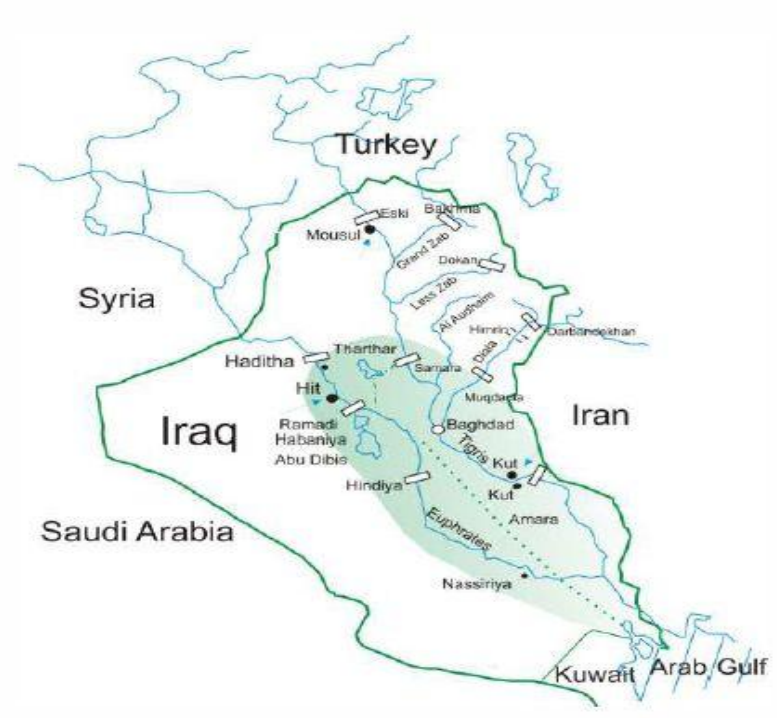
Figure 1: Map of Iraq with irrigated areas between Euphrates and Tigris Rivers.

Presence of shallow and saline groundwater is considered as one of the major reasons for increasing soil salinity problems in these regions (Pitman et al., 2004). Excessive irrigation and poor drainage conditions in irrigated areas of Iraq have contributed to rising groundwater tables leading to salinityinduced land degradation (Qureshi et al., 2013). According to recent estimates, rising groundwater tables and consequent soil salinity problems are damaging 5 percent of cultivated lands annually (USAID, 2004). Soil salinity has robbed the production potential of the 70 percent of the total irrigated area of Iraq with up to 30 percent gone completely out of production (Abrol et al., 1988: FAO, 2012). This situation has threatened the sustainability of irrigated agriculture which produces more than 70 percent of the total cereal production in Iraq (Schoup et al., 2005). Soil salinity is more prevalent in the central and southern parts of the country.